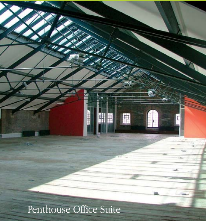
Penthouse Office Suite

This office comprises the entire ground, first and second floors of the award winning Warehouse building. The property, which overlooks Grand Canal Dock, benefits from superb natural light and has been finished to a high standard, providing bright and flexible accommodation that would suit a variety of uses. All floors are accessed at ground floor level via an impressive double height tiled reception area and they are predominantly open plan with the use of some cellular offices, tea station, 'break out' area, ladies and gents toilets and shower facilities. Internal finishes include an exposed structural steel room frame and partly exposed stone walls. There is a lift to the first and second floor with the added feature of two balconies overlooking the Dock.