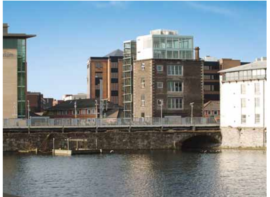
View from Grand Canal Dock

The new Grand Canal Dock area is evolving into Dublin's most fashionable and cultural commercial hot spot with a fantastic array of bars and restaurants. The new Grand Canal Performing Arts Centre designed by world renowned architect Daniel Libeskind is the centre focus of the 10,000 sq metre Grand Canal Square.